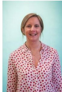
Senior Leader for Learning Support