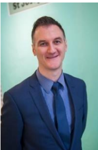
Senior Leader for Curriculum and Assessment