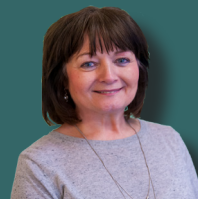
Vice Principal Deputy Designated Child Protection Teacher

The full policy document is available on request from the Principal