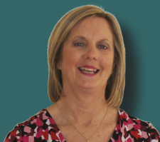
Designated Child Protection Teacher